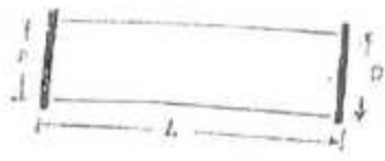
MSRL STRAIGHT PIPE & Reducers